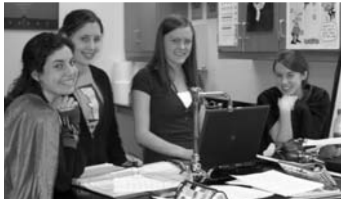
Students break during Science Lab and smile for the camera!

Thank you for your partnership in making the LHS learning experience the best it can be!