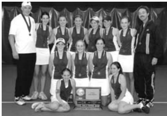
2006 Class A State Tennis Champions – 10-peat for the LHS girls!