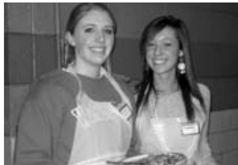
Spaghetti servers dish it up!

Saturday, January 27, 2007 marked the Annual LHS Senior Party Spaghetti Dinner held at the St. Pius X school cafeteria. Over 425 people enjoyed spaghetti, salad, garlic toast, dessert, and assorted beverages with food provided by the Canadian Honker restaurant and catering. Proceeds support the Senior Class Party, an all-night celebration following graduation that provides an opportunity for seniors to enjoy a safe and memorable night of great food, prizes, and entertainment.