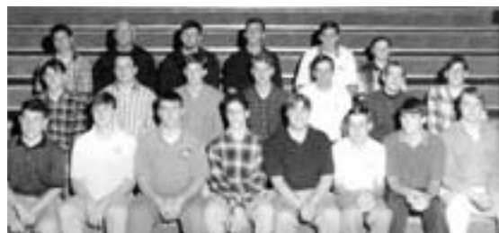
1995 Boys State Championship Golf Team