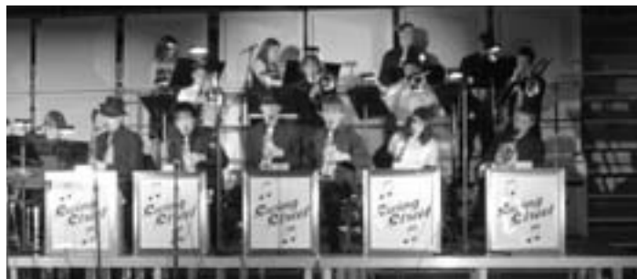
LHS Hi-Lighters perform a jazzy tune.

In the words of jazz great Count Basie, "Everything was mostly fun, the whole thing!"