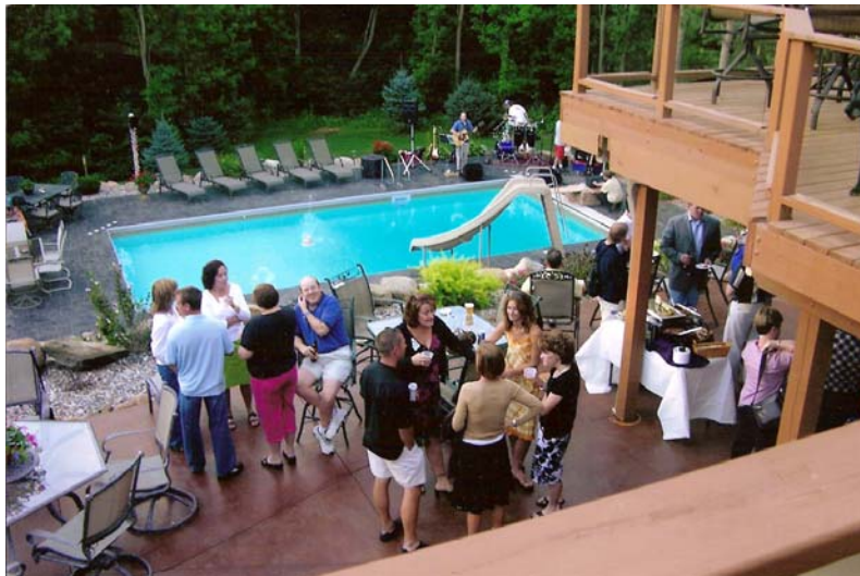
LHS Class of 1985 at a pool party