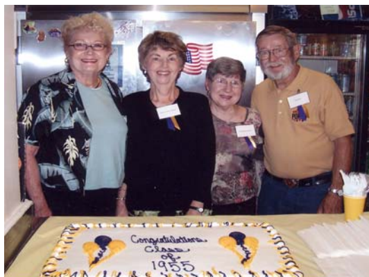
LHS Class of 1955 celebrates their 50 th reunion in the commons